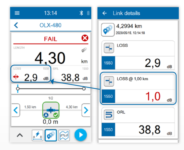
Figure 2. Optical Explorer highlights the target loss for the section up to demarcation point at 1 km is not met.

In FTTH last mile, the demarcation function is particularly helpful when a drop section (or vertical) of the link is installed and connected to the distribution fiber (horizontal). An installer can check that the section up to where the demarcation point meets the requirements (notably link length and loss) while providing full visibility for the operator on last mile optical health.