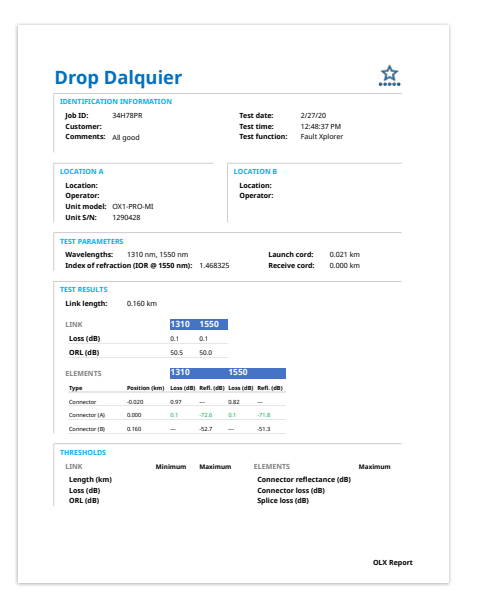
Figure 3. Example of measurement PDF report generated from the smart device

Go to www.EXFO.com/TestFlow for more details.