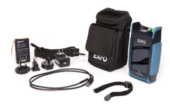
Figure 4. Optical Explorer starter kit

Complement your kit with optional spare Click-Out optical connector (PRO models only) and test cord boxes to optimize your Optical Explorer experience.