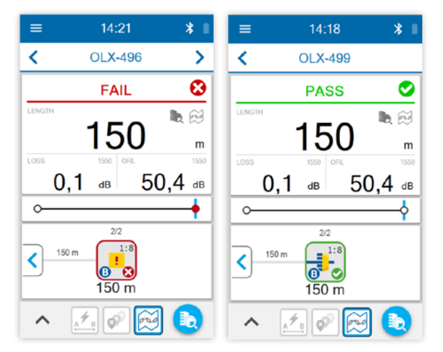
Figure 1. On the left, Optical Explorer informs the user that the expected splitter is not found. In second picture, Optical Explorer found the expected splitter, confirming link continuity.

FTTH last mile architectures come with their own set of challenges. Optical Explorer brings additional specialized tests to meet the needs of these use cases.